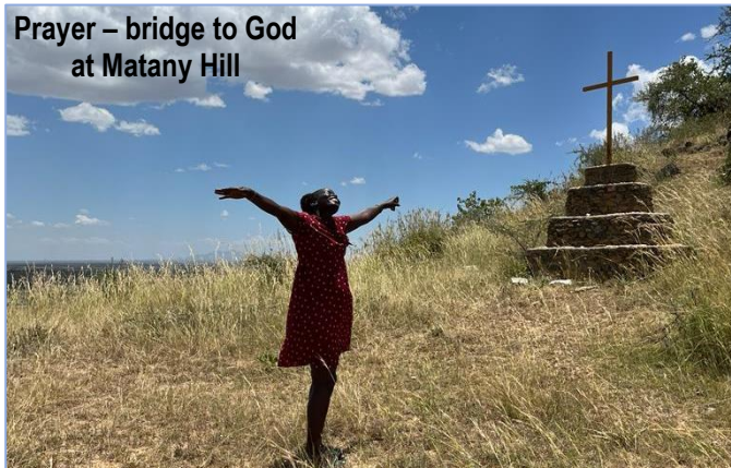
Prayer – bridge to God at Matany Hill

For some, Christmas is also a motivation to try again with God and to build a bridge in prayer from everyday life to the origin and goal of my life.