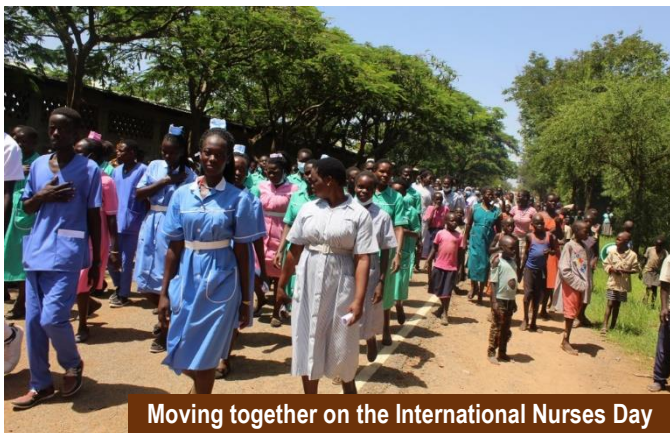
Moving together on the International Nurses Day

through their own means alone. This helps them to deeply understand our patients – people in vulnerable situations, often far from any stable support structures.