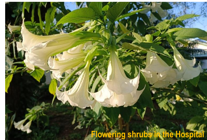
Flowering shrubs in the Hospital